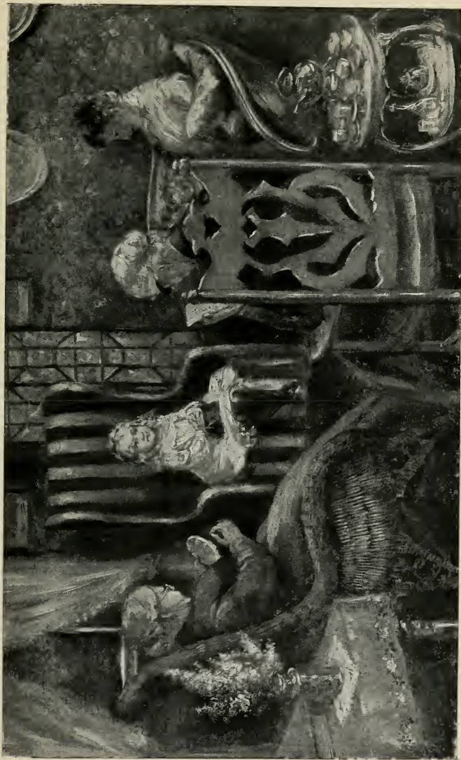
“Perching herself in an ancient arm-chair.” Page 194.